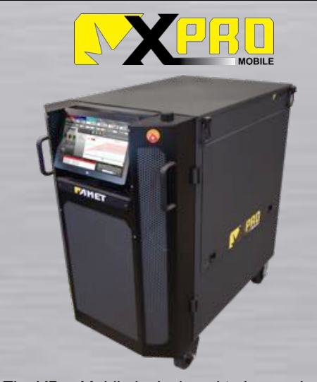
The XPro-Mobile is designed to be used with multiple welding fixtures.