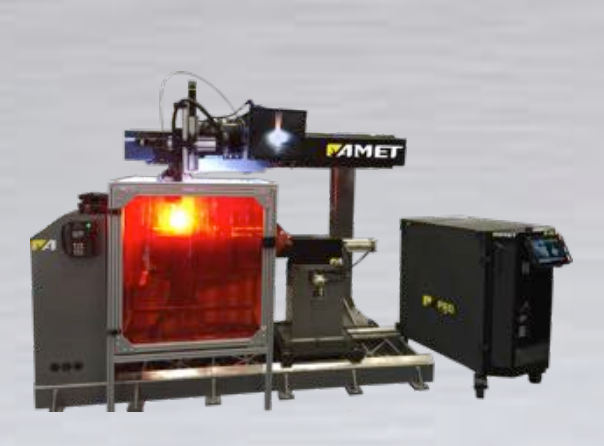
AMET Circumferential Welding System with XPro-Mobile weld controller

Note: Access to the Setup and Edit Screens can be limited by assigning each user a unique ID and password with customizable permissions.