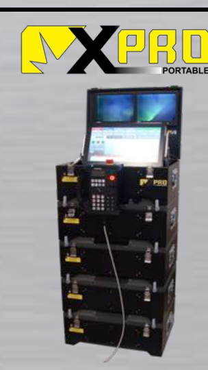
The XPro-Portable is designed for field use.