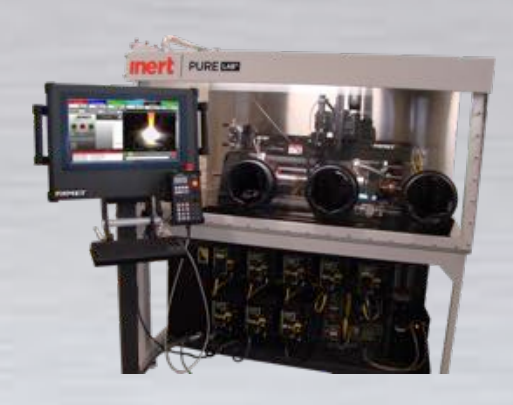
XPro GTA Custom Glovebox Lathe Welding System