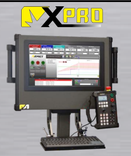
The XPro is the standard configuration.

The XPro Series of Weld Controls expands upon the same basic architecture as our proven XM Controller with precision control modules integrating the welding power supply and welding axes for a complete turnkey solution. However, the XPro Series has an increased capacity for tackling even the most demanding welding needs. It utilizes the same Digital Signal Processor (DSP) technology found in the XM, but adds an enhanced HMI (human machine interface) with a large touch screen and keyboard to make weld program creation and menu navigation even easier. The advanced hardware combined with the user-friendly interface results in a capable yet easy to program welding solution. Once created, weld programs can be initiated directly from the touch screen interface or the handheld remote pendant.