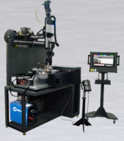
XPro GTA Welding System