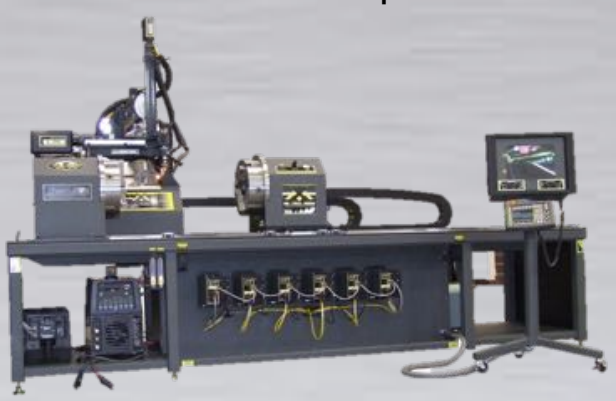
XM GTAW Twin Drive Heavy-Duty Bench Lathe