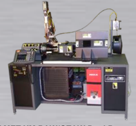
AMET XM PAW/GTAW Dual Process Precision Benchtop Lathe