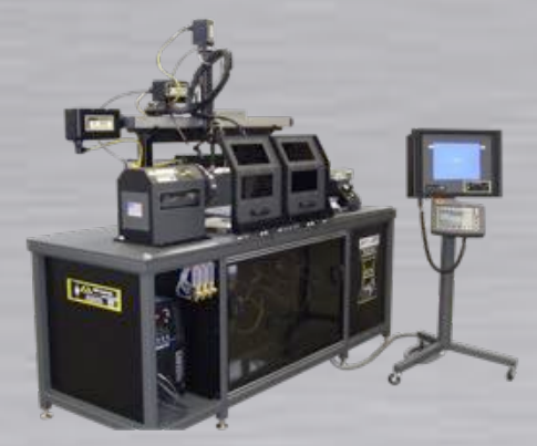
GTAW Heavy-Duty Bench Lathe with Camera System and Manually Adjustable Weld Screens