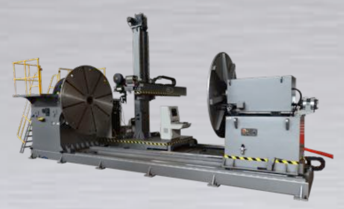
Large VPGTAW Industrial Weld Lathe with Custom Faceplates and Motorized Tilting Headstock.